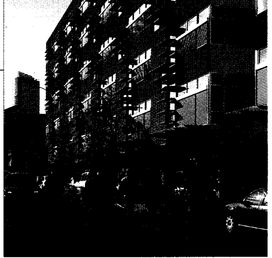
▲ One of a Few. Seattle office building is meeting target carbon-dioxide emission reductions.

developed by the Durst Organization, uses more energy per square foot than an older Durst building nearby, said Hinge.